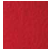
juicy berries 052A