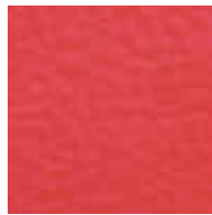
spikey wattle 503A