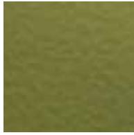
lush forest 802A