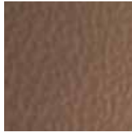
rugged land 462A