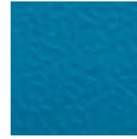
glistening dew 871A