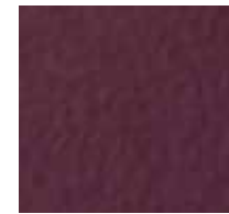
thorny thistle 592A