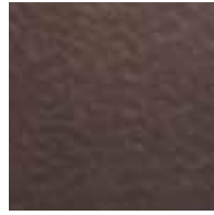
murky creek 463A