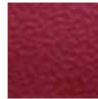
prickly pear 591A