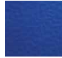
flowing stream 923A