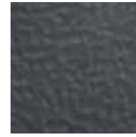
bumpy trail 332A