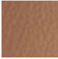
sandy beach 431A