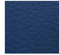
still water 921A