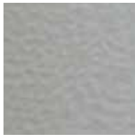
misty cave 033A

product tile size total thickness dimensional stability electrostatic propensity fire rating ISO 9239.1 carton size