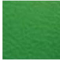
slimy frog 841A